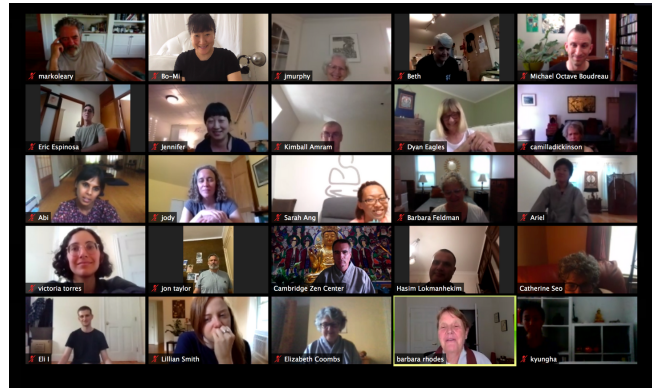
Circle Talk on Zoom with Zen Master Soeng Hyang

from Warsaw, Poland, to hit our minds with kong-ans. Thanks to Ian Maher’s initiative and dedication, there have been daily week-day sittings in the mornings and evenings from the very start of the lockdown. By now, our online practice schedule has expanded to additional