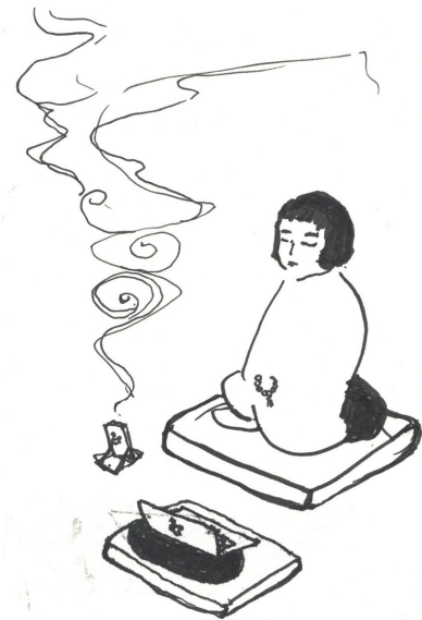
Original Drawing by Ying Yao

More practice is necessary at a time like this, that's for sure; more bowing, more sitting. Walking meditation has been really nice, to just go out and do quiet walks outside and appreciate the little things that in our busy, busy lives we lose sight of. So now we can return to retreating at home and recognizing how we make everything in our mind, how we're moving away from the moment all the time, and how to return back to it. For me in many ways it's a gift, a great gift. It's how you look at it.